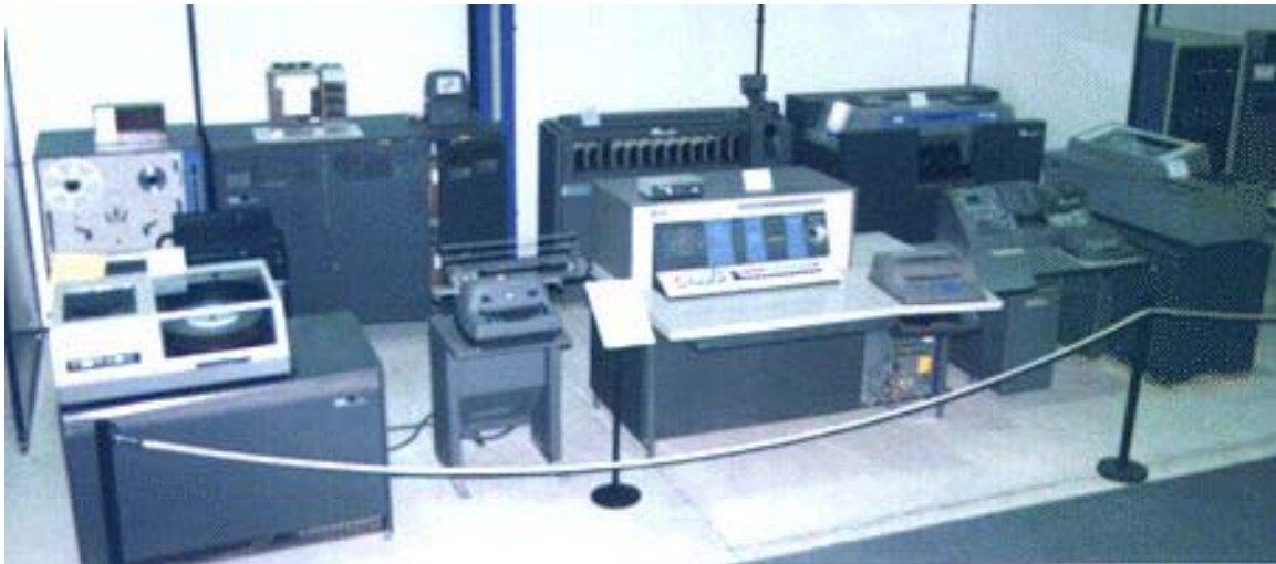
Figure 2: A 1960s-era computer.

Just a few decades ago, a computing center was one of the most important buildings on a university or corporate campus. Access to this building, particularly to the holy room where the computer functioned, was highly restricted. A computer occupied several rooms, if not floors, of a building, needed air conditioning, and required a specialized and trained staff to interact with it and run users' programs on it. A computer used to cost millions of dollars. Figure 2 shows a popular computer in late 1960s and early 1970s. Table 2 lists some of its important characteristics.